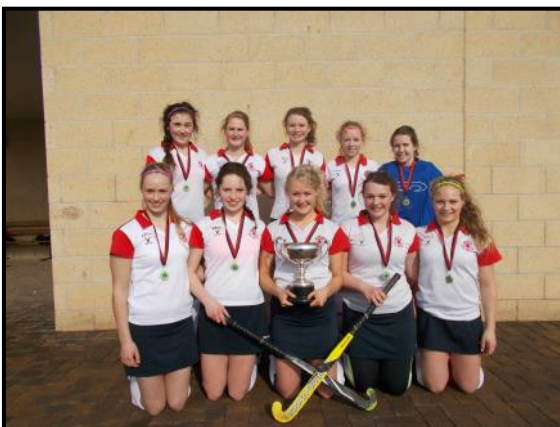
Winners - Kelso High School

The girls endured 4 seasons in one day on Wednesday 1 st April in the annual Berwickshire 7's tournament. Eight teams competed for the trophy this year with last year's winners George Watson's College the team to beat. All teams competed in pool matches before 2 semi-finals and a final. There was bad luck for the Berwickshire girls who had won 1, drawn 1 and lost 1 match in their pool, going out on goal difference (by 1 goal). It was a shame as the girls had performed well as a team. The final was competed by George Watson's and Kelso High School, with the Kelso girls coming out on top 2-1. Congratulations to them for winning the trophy.